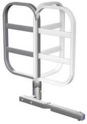
1. 3-Position Metal Assist

See reverse for product codes and bed pictures.