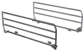
1. 3/4 Length Side Rails