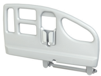
3. Molded 1/2 Head End Side Rail