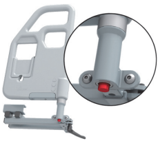
3. Molded 3-Position Assist