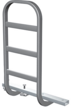
2. Fixed Universal Assist