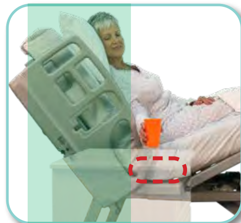
Encore: seat deck retracts during HOB elevation maintaining the user in a safer comfortable zone of vertical alignment (shaded green).